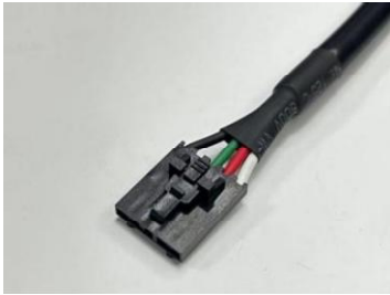
Wire Harness With PVC Tube (Without Shielding)