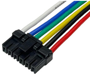
Wire Harness Ass'y (Receptacle)