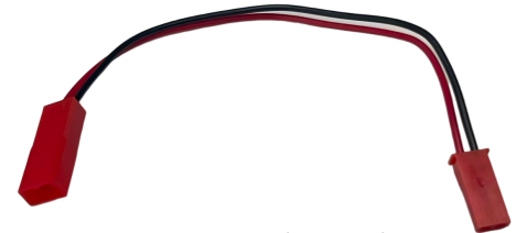
Extension Cable (F TO M)