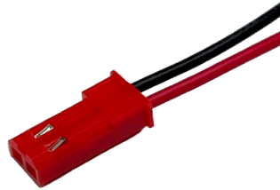
Plug Housing With Socket Terminal