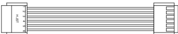
DUAL ENDS TYPE B 双头反向