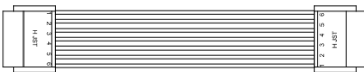
DUAL ENDS TYPE A 双头同向