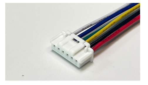
Wire Harness Assembly