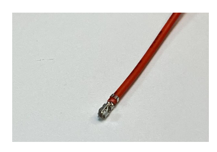
Single Crimped Lead